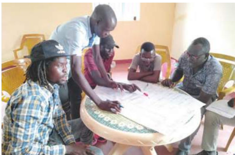
Putting participatory gender analysis into practice

Teachers at the target schools reported, as outcomes of the workshops above, not only increased understanding of menstruation but also improved self-esteem on the part of the girls and more active participation in classes and other school events . Regarding boys, the teachers observed a sharp drop in bullying of menstruating girls and also an increase in boys showing supportive attitudes to girls having menstruation . The project completion evaluation confirmed that 79% of respondents possessed basic knowledge on menstruation hygiene management. In order to promote gender mainstreaming, consideration was also given to the project implementation structure . For example, women facilitators from local community were selected wherever possible for leadership positions in the activity , while staff from the organization included a staff member with a degree in gender studies , who worked among others to raise awareness continuously of the other staff.