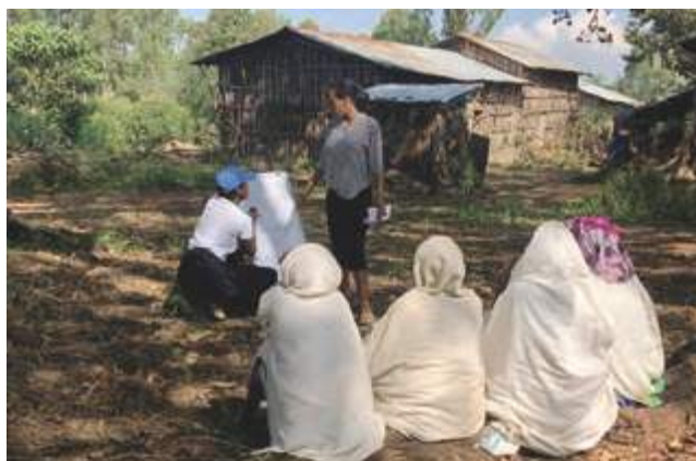
Sharing session (1)

Analysis with a gender perspective is possible without going through a specific “gender analysis” process by paying attention to the gender-based differences in the contexts of people around you in everyday life or activities (seeing with a gender lens). Try cultivating this kind of awareness: it will garner you large amounts of information, without needing to spend money.