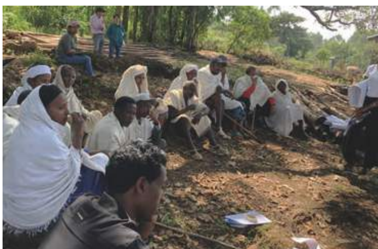
Group work using tools