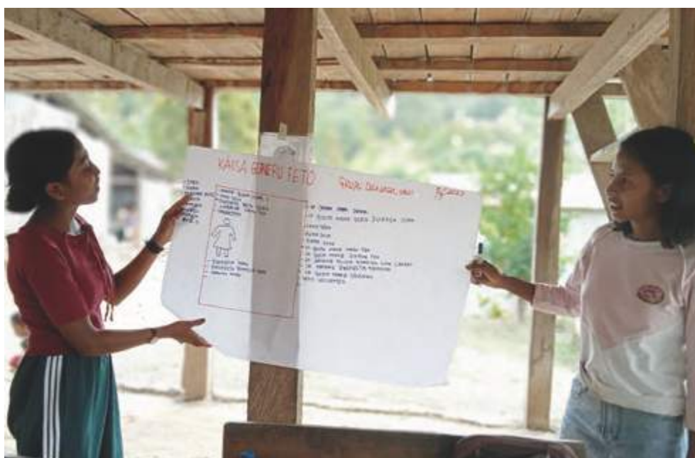
Using the gender box method, the women's group wrote stereotypes about women inside a square and images of women not conforming to the stereotypes outside the square, writing down and analyzing where these ideas derived from (learned at school, learned from grandparents, etc.).