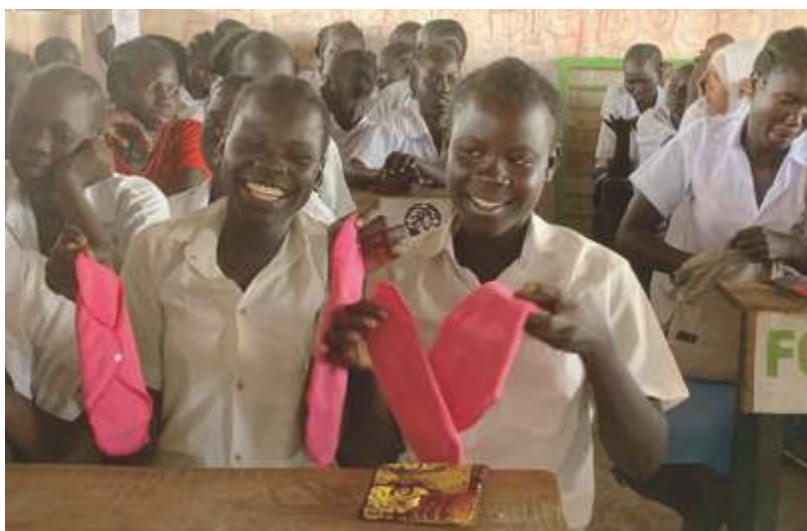
Girls receiving reusable cloth sanitary pads