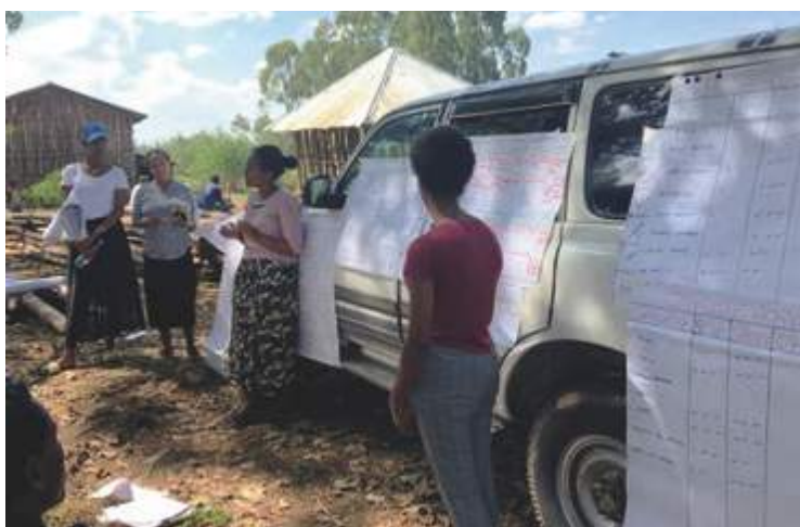
Sharing session (2)