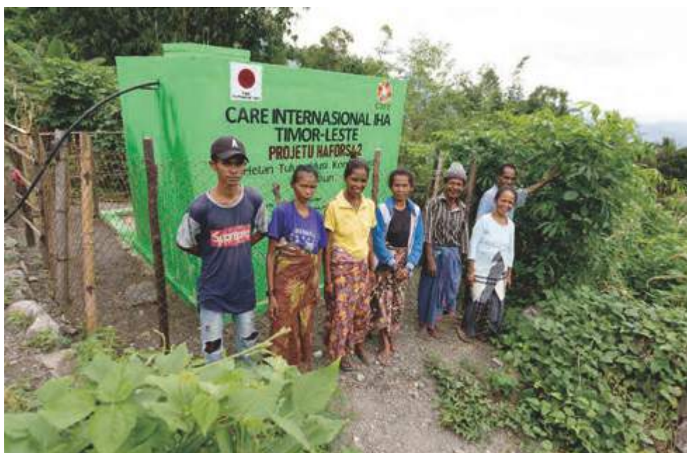
Agricultural water storage tank and farmer group members (water used for community ' daily needs as well as agriculture)