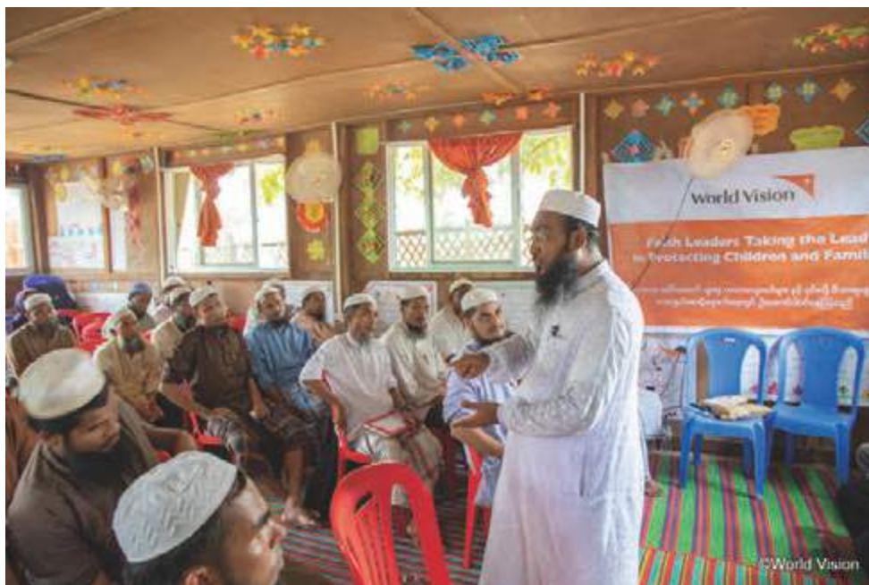
Religious leaders' meeting on child marriage